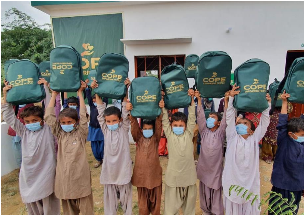
CHILDREN IN COPE'S SECOND SCHOOL PROUDLY SHOW OFF THEIR SCHOOL BAGS