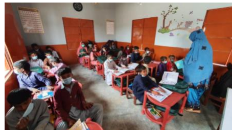
Above: A lesson being taught in COPE's second school, Sindh

When the Trustees visited Gudap, Sindh, the villagers asked for a school for their children. This village has a water station, with the masjid still being under construction. The school was completed at the end of November 2020, with all the resources ready for children to be educated, such as bags, books, a chalkboard and even a little playground. More footage from the school can be found on the COPE Instagram and Facebook pages.