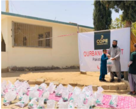
Above: COPE meat distribution in Pakistan

donors to do their sacrifice in the area of Cameroon as part of Qurbani 2020.