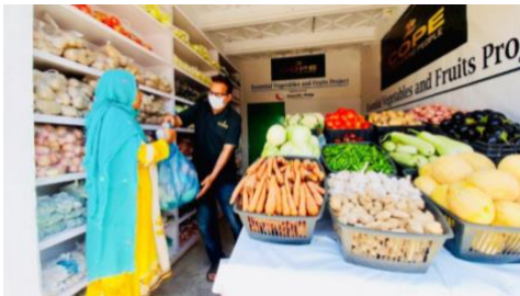
Below: COPE fruit and vegetable market

We are extremely proud to have pioneered a Fruit and Vegetable Project during Ramadan and beyond whereby poor people were able to have access to fresh fruit and vegetables free of charge. COPE set up a temporary Fruit and Vegetable market in the slum area of Karachi and issued ration vouchers for poor families that met the criteria. Hundreds of poor people benefitted from this initiative. The market has continued beyond Ramadan and is still running and benefitting hundreds of families daily. COPE believes in protecting the dignity and self-respect of poor people and we are thankful for the opportunity to give hundreds of people access to free, nourishing fruit and vegetables.