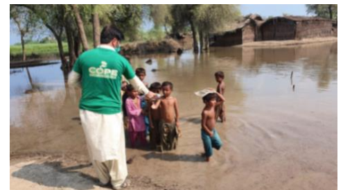
Above: Distribution by COPE team in Sindh

80 food packs, 150 mosquito nets to the affected villages and families in Sindh.