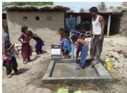
Above: People using one of the water pumps: these pictures are sent to the donor of that pump to show them what they funded

Our water project is thriving and we are delighted to report that we have funded 600 water pumps up until the end of December 2020. Water pumps are a great source of sadqa jaria which means that your act of charity continues to benefit you as long as water is consumed from the water pump. Many donors have taken to the idea of gifting a water pump in the name of a loved one to mark their special day, whether that is their birthday, anniversary or in the name of a loved one that has passed away. COPE sends off all new water pump orders on the 5 th of every month and advises donors of a 6-16-week turnaround. Due to recent events including the Covid Pandemic and Floods in Pakistan, we are experiencing a delay and would request donors to remain patient. Once the work is completed, donors are provided with pictures of their water pump and a full report.